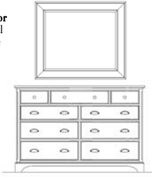
1401 Media Dresser 60" x 19" x 40" H. Nine Drawers, Center Drawer Dropfront for AV Components, Jewelry Compartment, Bottom Drawers Cedar Lined