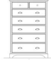
1408 Chest 40" x 19" x 60" H. Seven Drawers, Bottom Drawer Cedar Lined